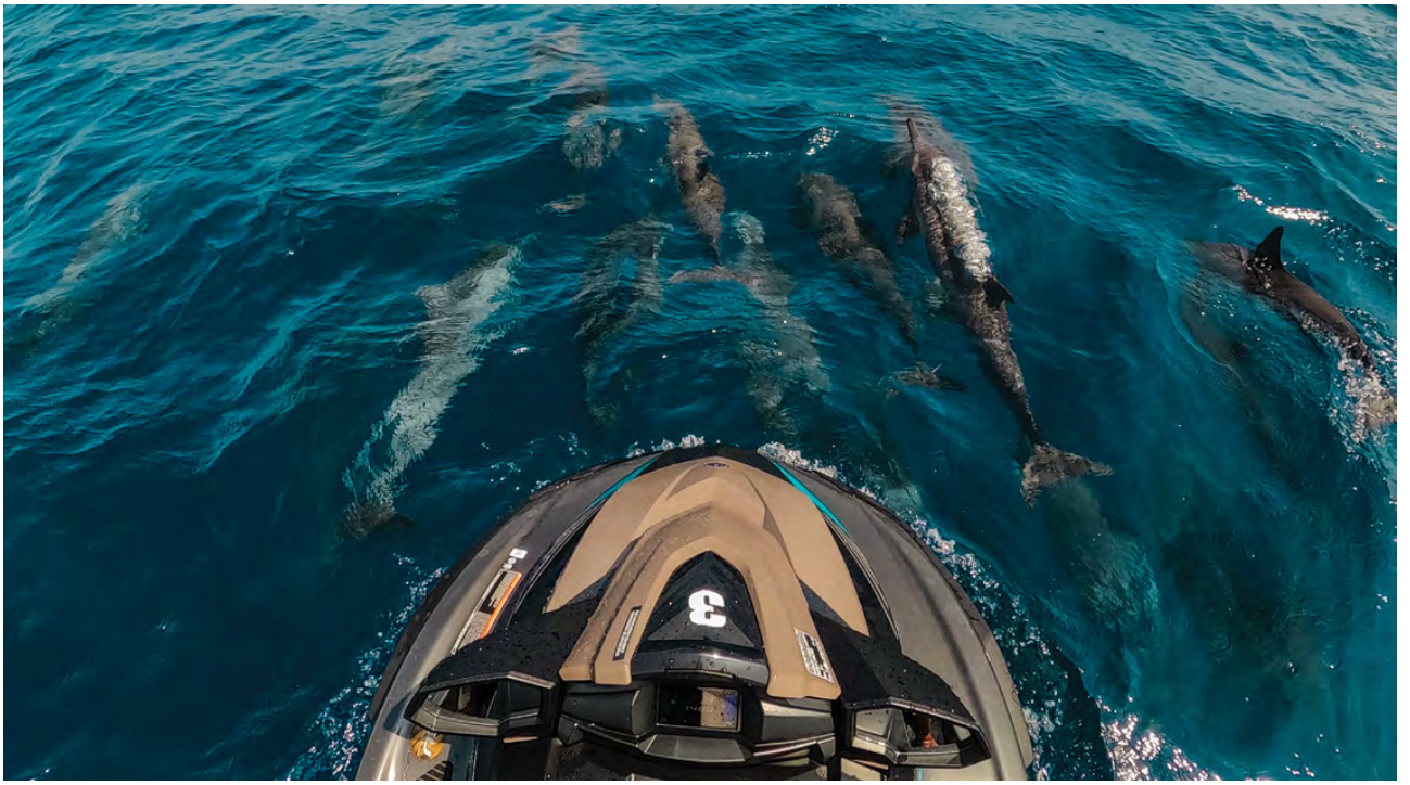
FUN RIDE & DOLPHIN 1-2 guests 1 hour