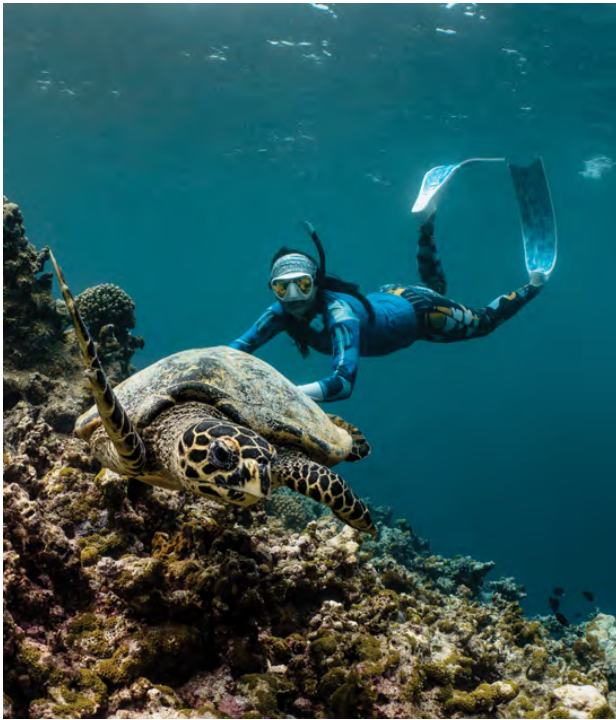
TURTLE SNORKELLING, SANDBANK 1-2 guests 2 hours