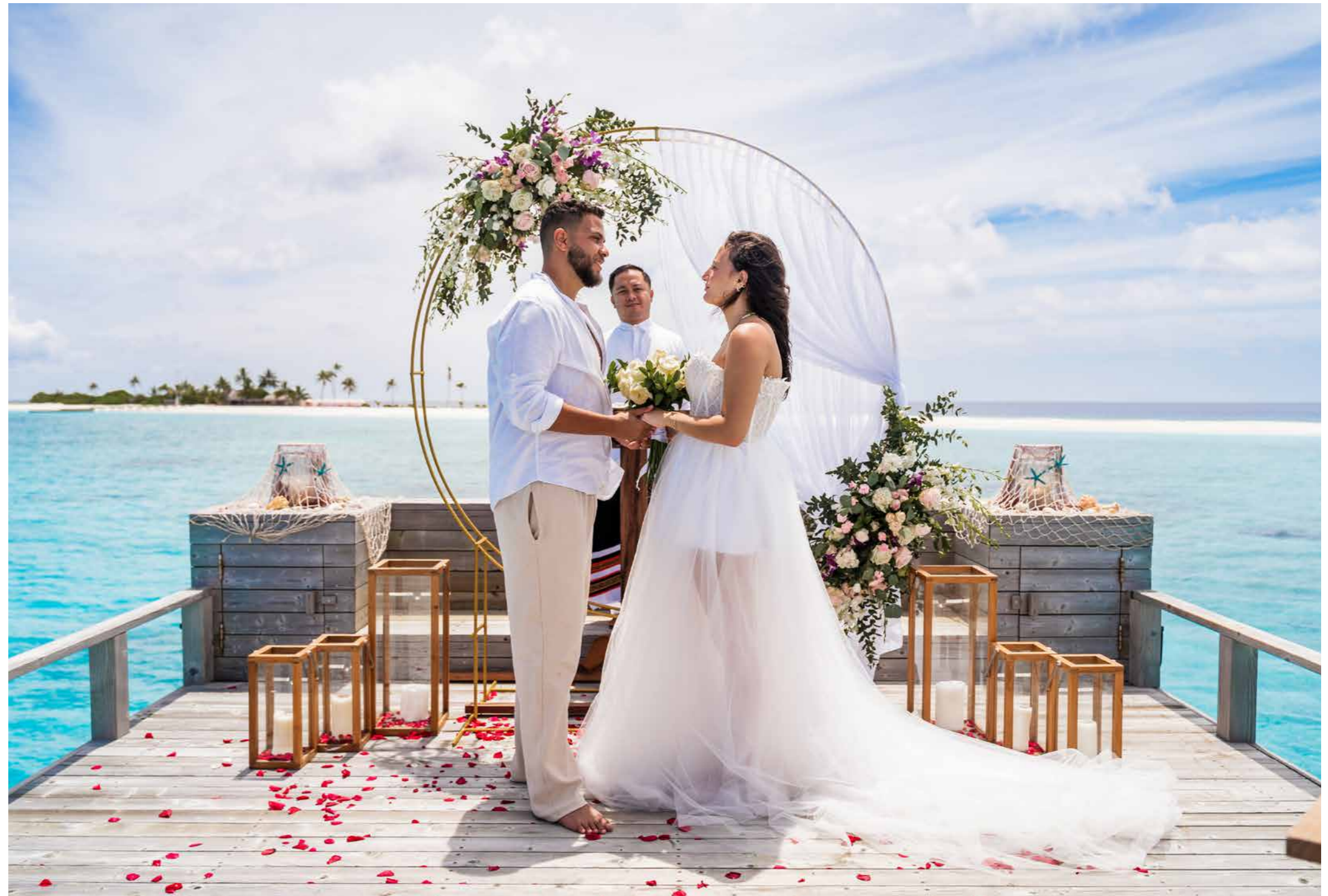
DHAAIMEE “HEARTBEAT” (USD 3400++)